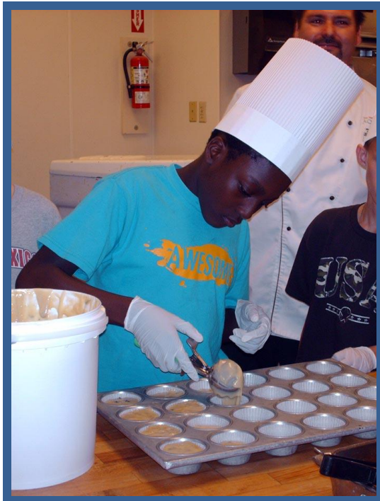
“Kids in the Kitchen” tour the Aquarius in Laughlin