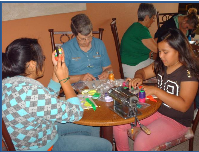
Members enrolled in Arts & Crafts shown working on "Bottles of Hope," as part of a partnership with the We Care Cancer Support Center.

The staff of the Boys & Girls Clubs of the Colorado River is required by law to report any signs or suspicions of abuse or neglect to Child Protective Services. Club Staff are trained by C.P.S. officers to recognize signs of abuse and neglect.