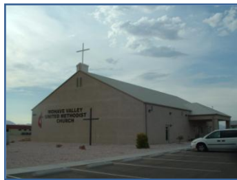
Fort Mohave Unit