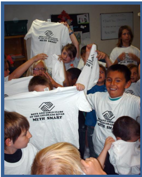
Meth SMART graduates show off their free t-shirts!