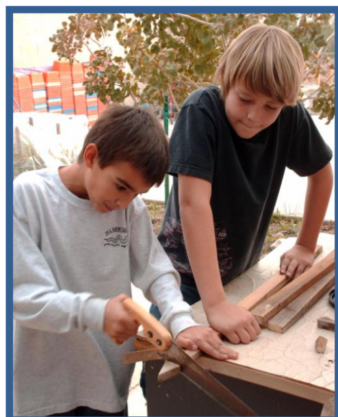
Torch Club members using hand tools while making repairs to their greenhouse.