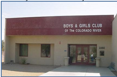
Bullhead City Unit

Our programs are designed to instill a sense of belonging, competence, usefulness and power of influence into each and every member. Our full time professional staff provides members with positive role models that truly care about the youth that they serve.